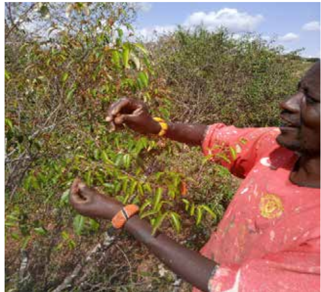
Picture demonstrating flowers blooming as a weather prediction method. Lodekejek, Samburu. 11/06/2021, Alphonse Mollo.

Pastoralists who view CIS as "not so useful" in aiding adaptation practices believe that useful climate information should include climate predictions alongside information on potential conflict areas, and locations with pastures and water. They further suggest that CIS and NGO intermediaries need a communication channel where they can report on actual weather.